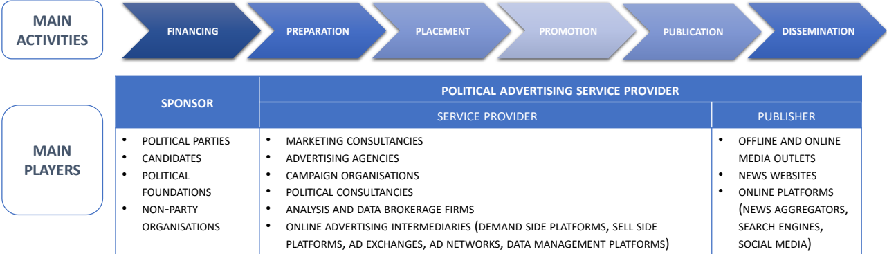
Fig. 1 – Political advertising value chain scheme as from the proposal of Regulation

In addition to the heterogeneity of players and activities, the political advertising market is also characterised by a variety of formats that advertising content can take and by the significant use of technology, especially online. Indeed, like commercial advertising, political advertising may consist of paid content (including so called issue-based ads), promotion in rankings, sponsored search results, paid targeted content, promotion of political views within commercial advertisements or through endorsers and influencers, organic advertising.